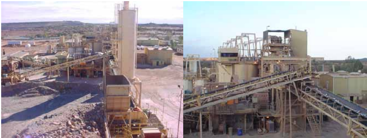
Figure 1 – 1Mtpa Fortnum Gold Processing Plant